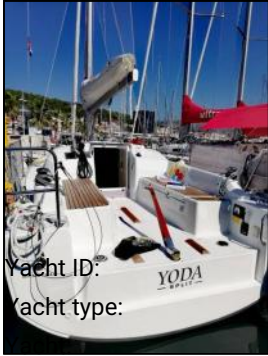
Yacht ID: Yacht type:

Marina: Production year: Cabins: Deposit: